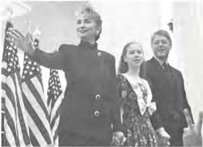
The Clinton family—Hillary, Chelsea and Bill.

"We need a new covenant for change based on a simple idea: it is the government's responsibility to help those who need help and create opportunity for all; and it is every citizen's responsibility to take advantage of that opportunity, become a productive citizen and strengthen his or her country."