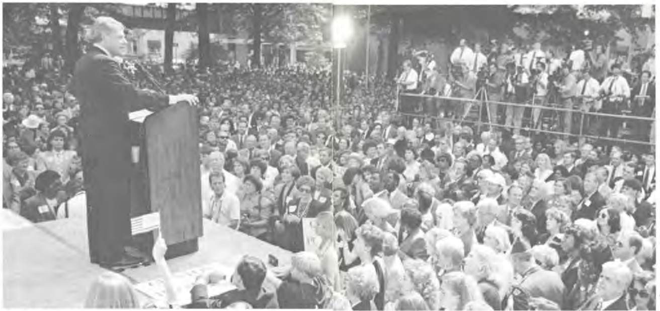
October 3—a historic day... Governor Bill Clinton announces his candidacy for president.