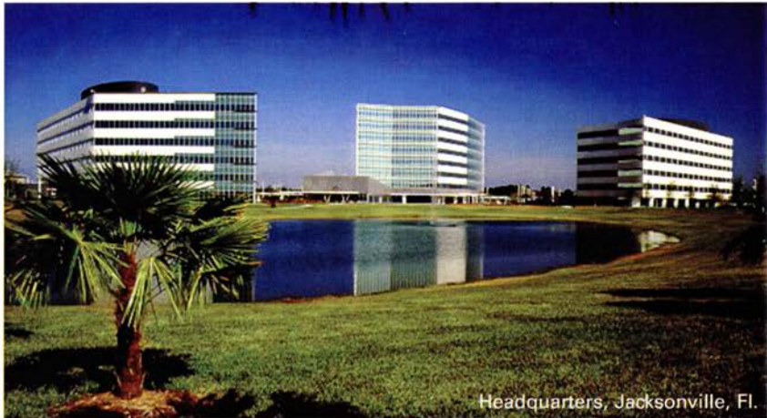
Headquarters, Jacksonville, FL.

An Independent Licensee of the Blue Cross and Blue Shield Association