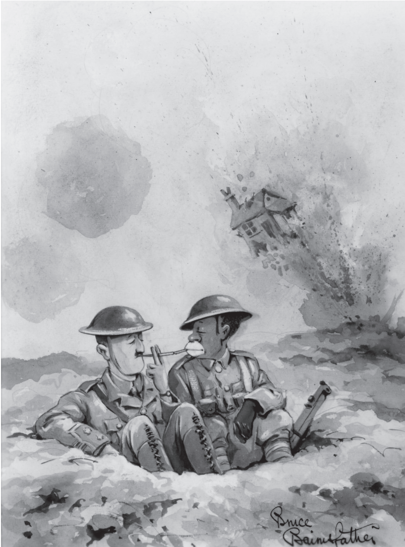
Figure 2. Gouache drawing in the Library of Congress: “Colonel Sir Valtravers Plantagenet gladly accepts a light, during a slight lull in the barrage, from a private in the Benin Rifles.”

In the late 1930s, 1940s, and 1950s, cigarette smoking among adults became so widespread as to be unremarkable, unexception-