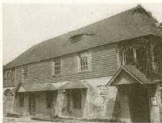
Oldest House in U. S. A.