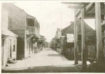
St. George Street