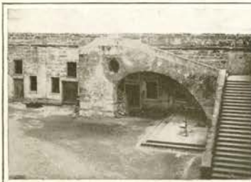
Interior Fort Marion

St. Augustine still retains all of its ancient physical appearance; St. George, its principal business street, being a narrow thoroughfare of quaint buildings and stores that reverts the mind to the days of Spanish glory. Possibly no other place in America so forcibly portrays to the modern eye and mind the character of the people and living conditions of old Spain as does this quaint city. Here you will see the oldest house in America and many others almost as old, picturesque narrow streets, the wonderful sea wall that took 200 years to build, making a river promenade resembling the board walk, old Spanish churches, beautiful modern churches, the slave market, Plaza de la Constitution, and many other places too numerous to mention; and contrasted with all of this is the modern environment of a new city, ample hotel facilities, golf courses, boating, bathing, fishing and all the outdoor sports and exercises that make modern outdoor life enjoyable. This is the St. Augustine of to-day, and not far different from the St. Augustine of a few hundred years ago—the ancient city of the new world, a city of unlimited historical interest, with an ideal climate the year around. It is worth going miles to see, and a tour of Florida is only half complete without a visit to St. Augustine, the pride of Patriotic America.