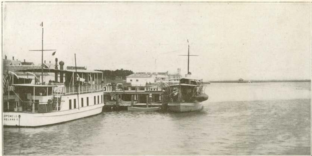
In Front of the Monson