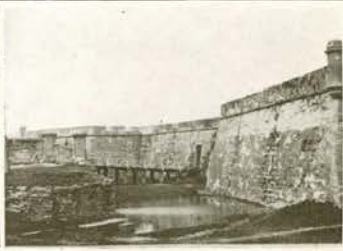
Exterior Fort Marion