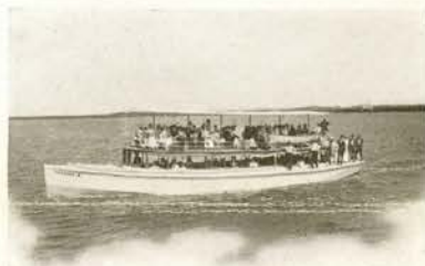
Ferryboat to Beach

S T. AUGUSTINE, the Ancient City of America, situated on a peninsula facing the Bay of Mantanzas, was discovered in 1513 by Ponce de Leon, founded fifty-two years later by Pedro Menendez de Aviles and a colony from Spain. The first fort was built of logs, and after numerous battles with the Indians, was destroyed in 1856 by Sir Francis Drake. The second fort, then called San Marco Castle, was begun in 1592 and finished in 1756. It is built of Coquina, a shell formation discovered about this time and peculiar to this section of the world.