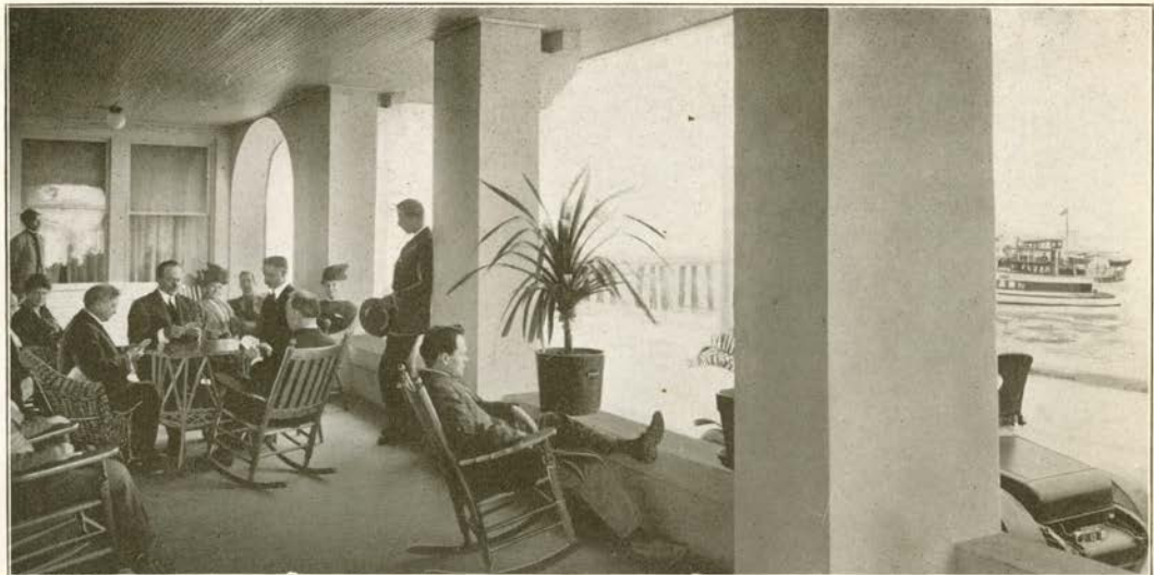
Looking from Porch of The Monson